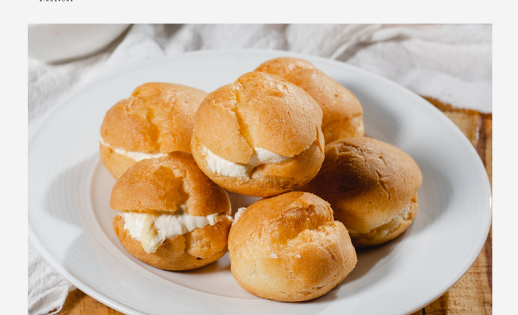
CREAM / CUSTARD / MANGO PUFF