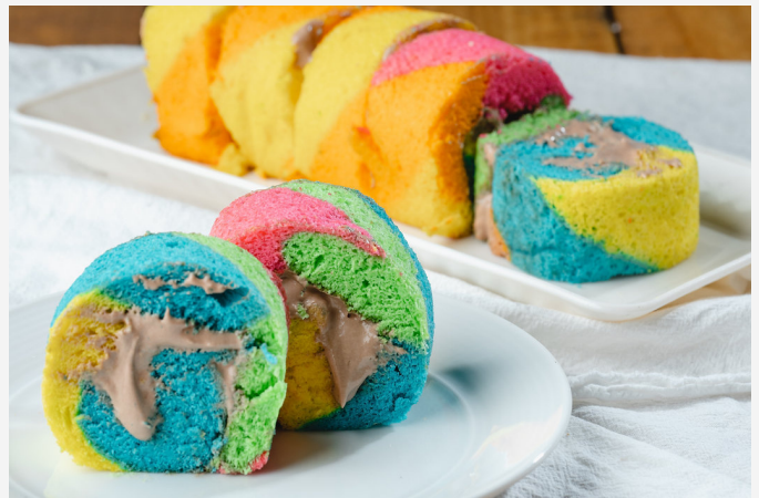
RAINBOW SWISS ROLL +$1.00