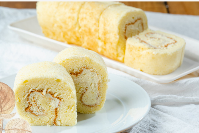
DURIAN SWISS ROLL +$1.00