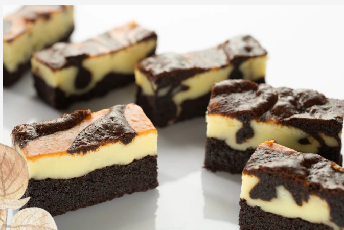
CHEESE MARBLE BROWNIE