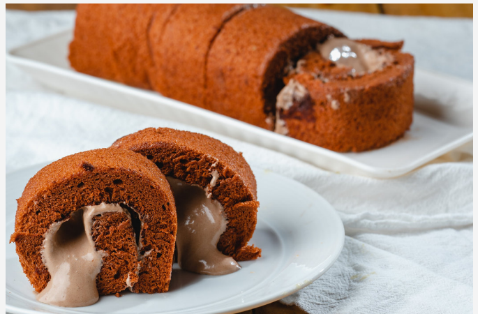
CHOCO HAZELNUT SWISS ROLL +$1.00