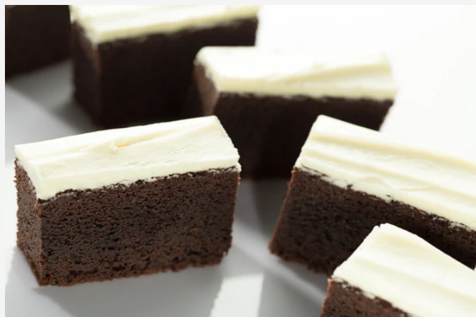
WHITE CHOCOLATE BROWNIE