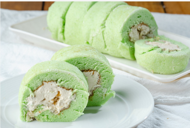
ONDEH-ONDEH SWISS ROLL +$1.00