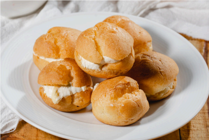
CUSTARD / CREAM PUFF (DURIAN +$0.50)