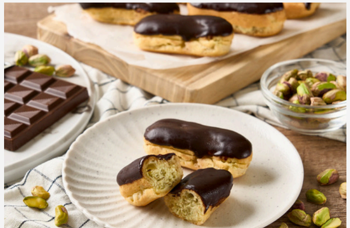
PISTACHIO ECLAIRS (NEW!) +$0.50