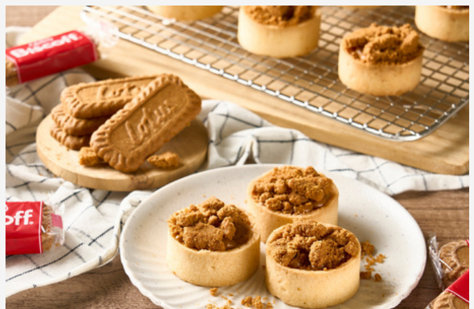
MINI BISCOFF CHEESE TARTS +$0.50