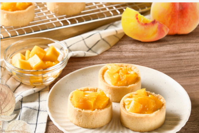
MINI PEACH CHEESE TARTS +$0.50

*Other tart flavors: Salted Caramel | Kinder B Oreo Cheese | Blueberry | Taro Coconut | Tiramisu | Lychee Rose