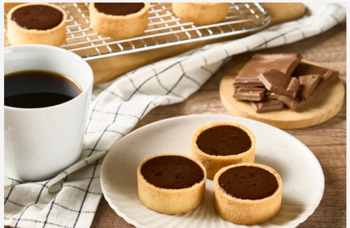
MINI HAZELNUT TARTS +$0.50

*Other tart flavors: Salted Caramel | Kinder B Oreo Cheese | Blueberry | Taro Coconut | Tiramisu | Lychee Rose