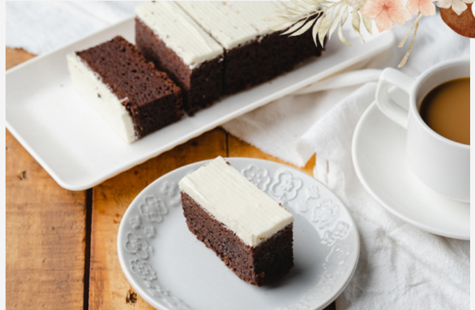
WHITE CHOCOLATE BROWNIES