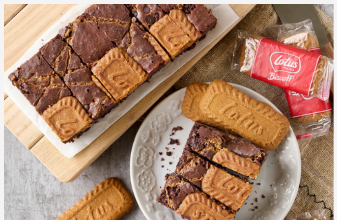
BROWNIES BISCOFF (NEW!)