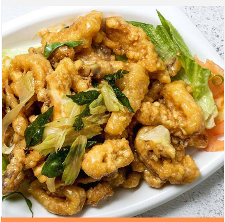
S3 Fried Milky Cheese Solong