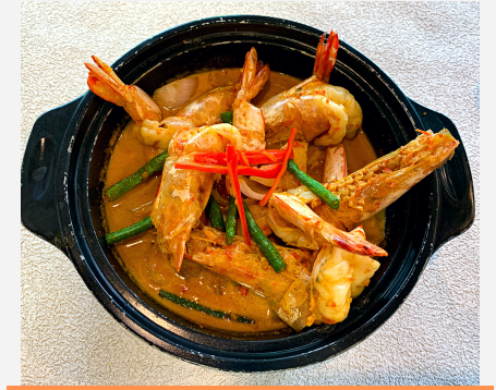
P3 Nonya Style Prawn

PI CEREAL BUTTER PRAWN 💘 P2 BLACK PEPPER PRAWN 🌙 P3 NONYA STYLE PRAWN 🌙 🐂 P4A SALTED EGG PRAWN (DRY) 幌 P4B SALTED EGG PRAWN (WET) *NFW* P5 SAMBAL CHILLI PRAWN 🌙 P6 SALAD PRAWN P7 SWEET & SOUR PRAWN P8 CHEF'S SPECIAL PRAWNS WITH CRISPY FISH STRIPS *NEW* 幌 P9 CLAYPOT CURRY PRAWN 🌙 P10 FRIED PRAWN FRITTERS *NEW* P11 FRAGRANT CHILLI PRAWN 🌙