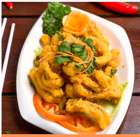
S8A Salted Egg Sotong (Dry)