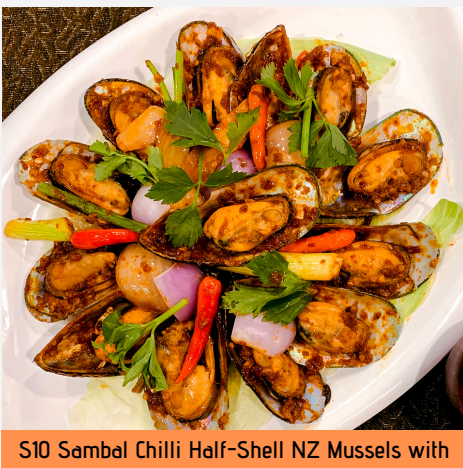
Onion & Ginger (New)