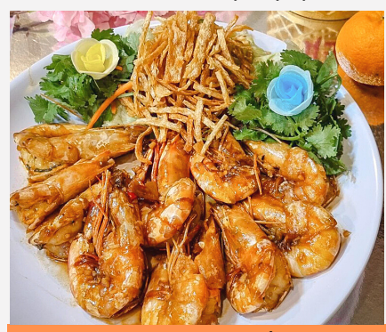
P8 Chef's Special Prawn w/ Fish Strips