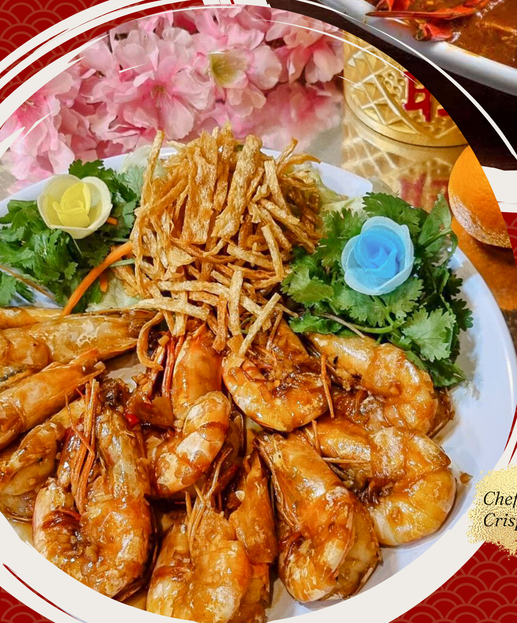
Chef's Special King Prawns with Crispy Fish Strips 金丝龙须虾